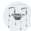
FOLDING POWDER COATED ALUMINUM COMMUNE-3 IN 1