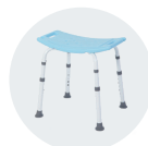
DELUXE SHOWER BENCH